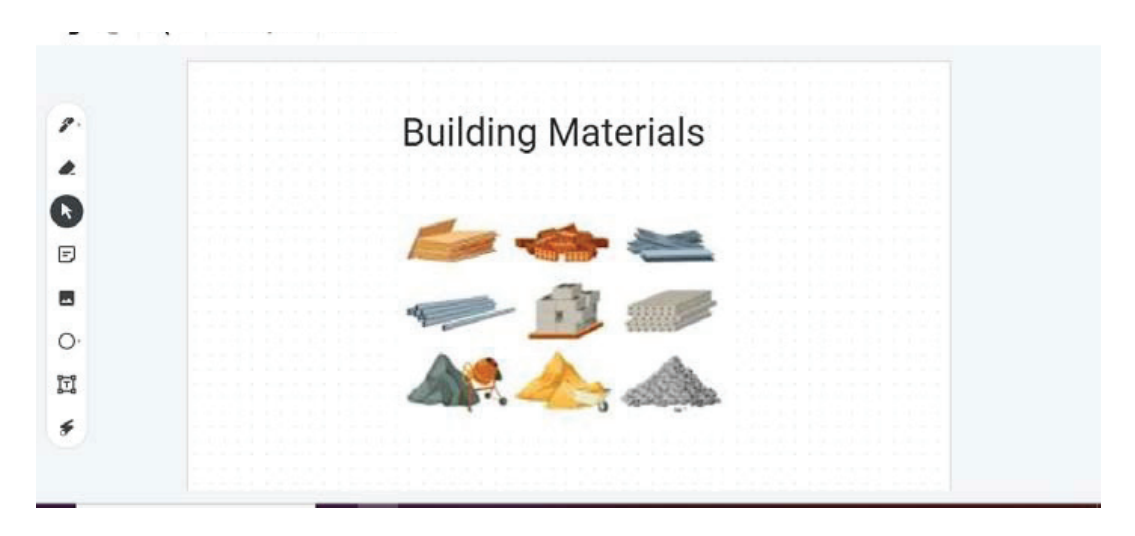
Fig. 2. Illustration of building materials with Jamboard app

Another idea for a pre-watching activity is revision of the names of various building materials that can be utilized in construction. For this purpose, the teacher shows pictures and designes the exercises with the help of Jamboard application (see Fig.2), for example: